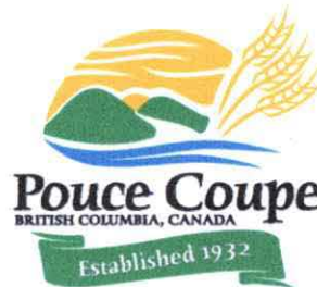
Village of Pouce Coupe